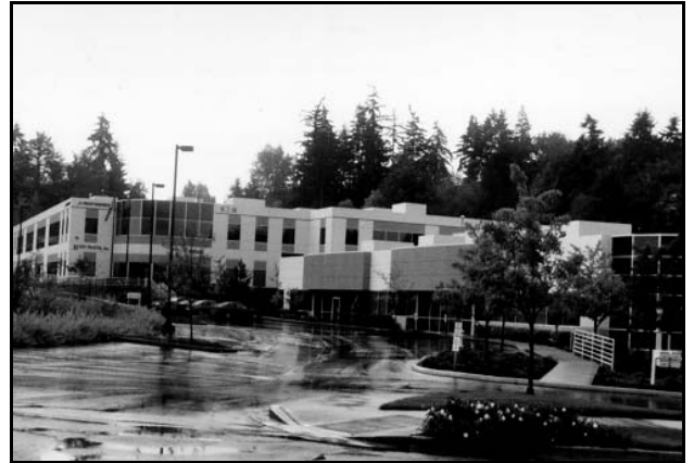
405 Corporate Center

Policy LU-6.1: Provide opportunities for light industrial and high technology uses.