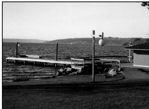
Houghton Beach Park

Policy LU-7.1: Preserve and enhance the natural and aesthetic qualities of shoreline areas while allowing reasonable development to meet the needs of the City and its residents.