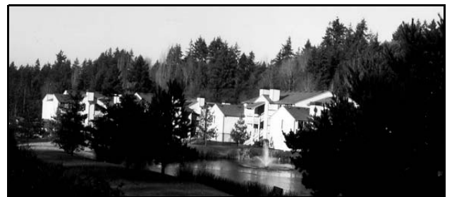
The Park at Forbes Creek Apartments

Policy LU-1.5: Regulate land use and development in environmentally sensitive areas to ensure environmental quality and avoid unnecessary public and private costs.