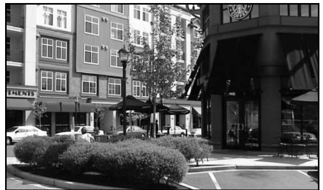
Juanita Village as a mixed-use center

Kirkland presently has a fairly complete network of commercial and employment centers, and many of the City’s residential neighborhoods can easily access a shopping area. This policy attempts to further strengthen the relationship between urban neighborhoods and commercial development areas.