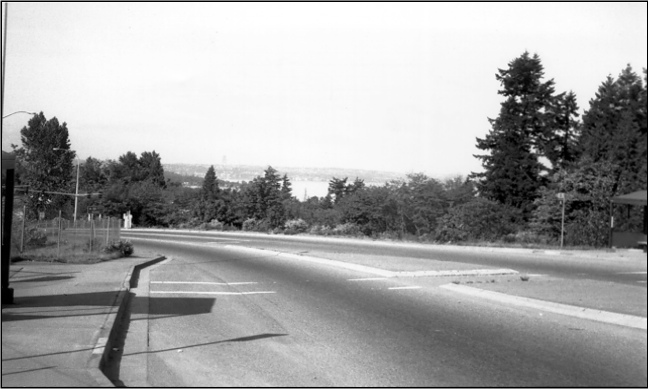
Figure E-4: Everest Gateway

The NE 70th Street overpass of I-405 is a PATHWAY connecting the Everest and Bridle Trails Neighborhoods. It constitutes a GATEWAY to these neighborhoods from the Interstate. It's most significant urban design asset is the TERRITORIAL VIEW it affords of Evergreen Point, the floating bridge, Madison Park, the Seattle Central Business District, and even the Space Needle. This VIEW is priceless in conveying a 'sense of place' and should be protected by limiting or prohibiting obstructions.